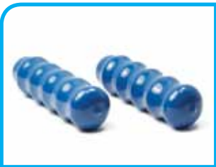
Convoluted Grip | p.10