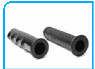
Industrial Grips | p.19