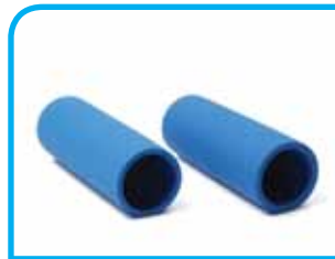
Foam Sleeve | p.34