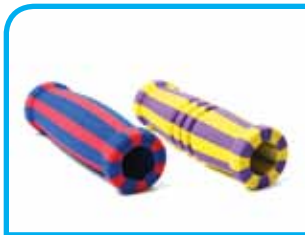
Foam Grips | p.31