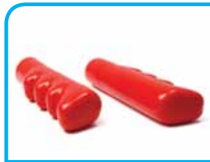
Angled Finger Nub Grip | p.12