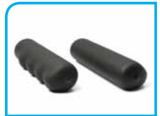
Textured Finger Nub Grip | p.12