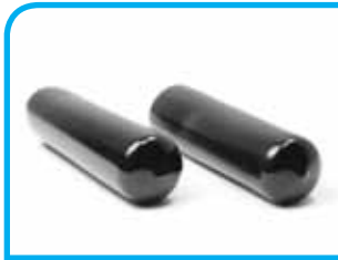
Straight Sided Grip Gloss | p.5