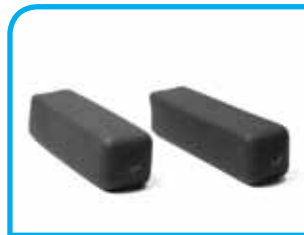
Square Grip | p.18