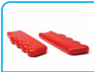
Flat Sleeve Finger Nub Gloss | p.17