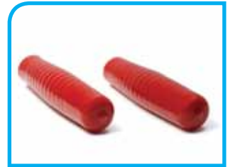
Ribbed Grip | p.10