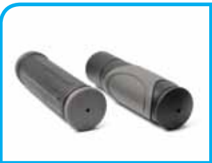
Rubber Grips | p.25