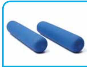
Straight Sided Grip Textured | p.8