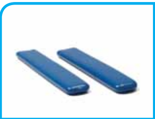
Flat Sleeve Gloss | p.13