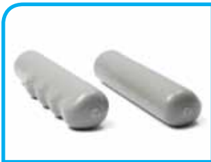
Finger Nub Grip | p.11